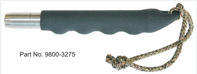
Part No. 9800-3275

We thought about it at length, slept on it, and then thought about it some more. Hey, since we offer air pipe fittings for half inch CA 3131 air pipe and cable pressurization equipment and tools of all types, why not make an air pipe reamer to simplify the job of connecting half inch air pipe, installing Flow Finders, Manifold Assemblies, etc.?